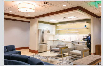
One Club (Kitchen)