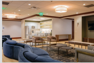
One Club (Living Room)