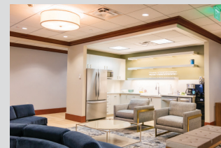
One Club (Kitchen)