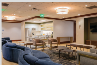
One Club (Living Room)